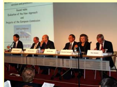
Round table discussion on the Review of the New Approach

The main tenor expressed by all parties involved was that the New Approach (NA) is a success and that a revision of some aspects is worthwhile. All parties agreed on the need for improvement of market surveillance and a harmonised and efficient notification process, however concerning CE marking views were controversial.