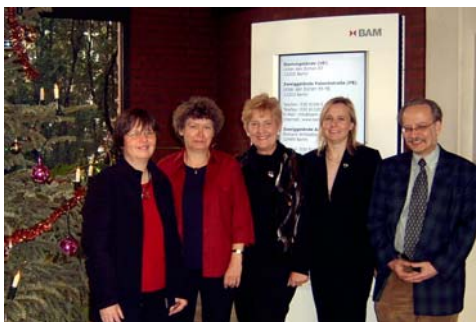
The team of the EUROLAB Secretariat

Bidding farewell to all of you and wishing you a Merry Christmas !