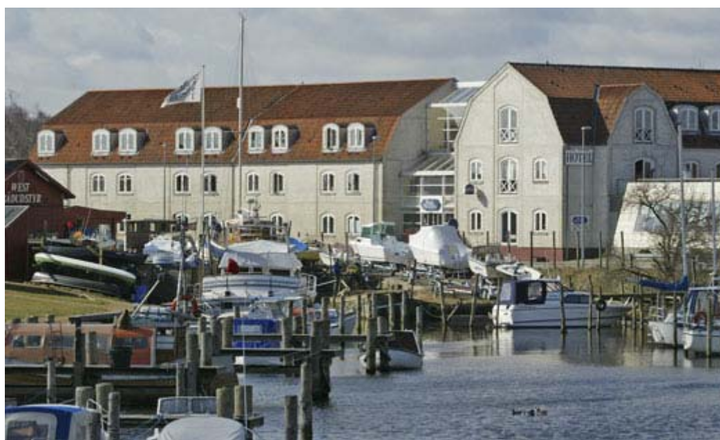
Hotel Niels Juel at the seaside just south of Copenhagen in Denmark

..... looking forward to welcoming you in Copenhagen ☺